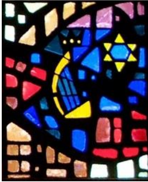
Window: King David