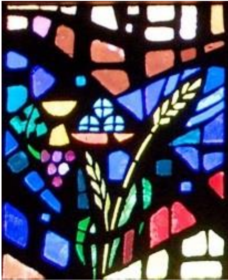
Window: The Last Supper